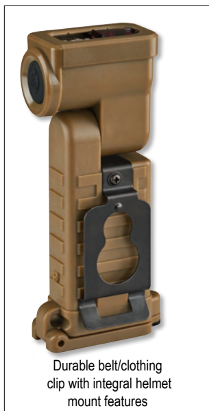
Durable belt/clothing clip with integral helmet mount features