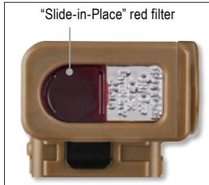
"Slide-in-Place" red filter

The Sidewinder Boot is the new standard flashlight for boot camp, recruit/basic training and wherever extra military instruction occurs.