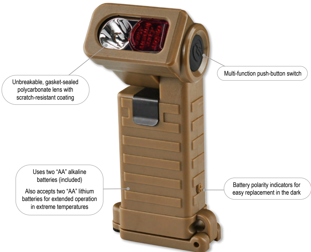
Unbreakable, gasket-sealed polycarbonate lens with scratch-resistant coating