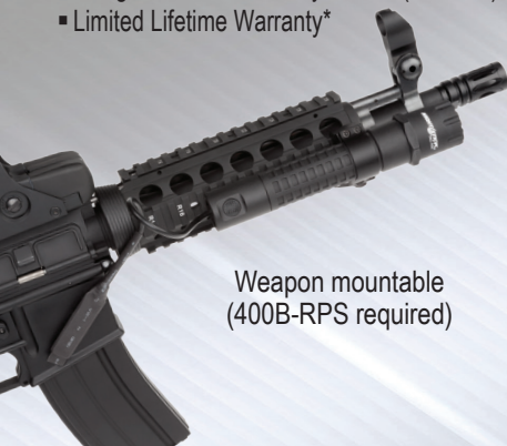
Weapon mountable (400B-RPS required)