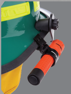
Multi-angle helmet mount