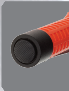
Large textured tail-switch